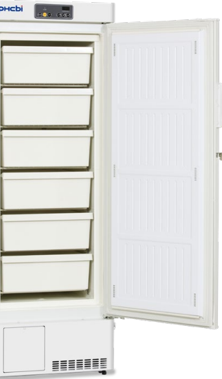
Model MDF-MU339HL-PA shown with optional storage bins.